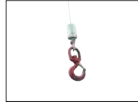
Safety: homologated self locking swivel hook